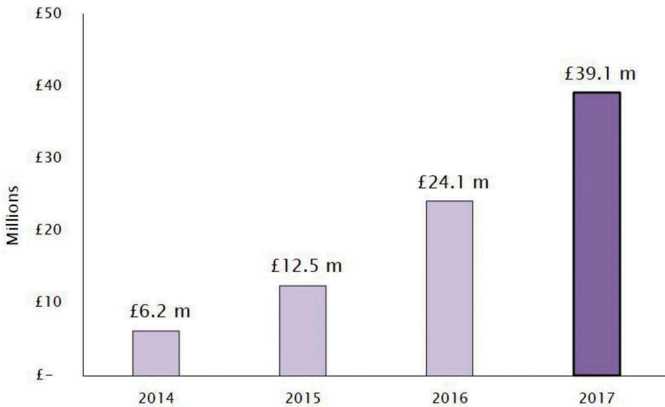
Figure 3. HMRC's spend on private debt collectors.